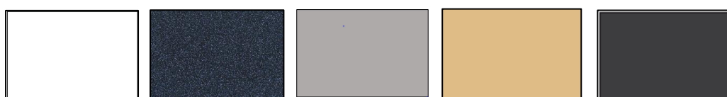
white anthracite structure silver beige anthracite